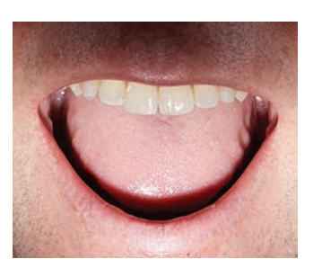
3 Intensity Level Settings

Settings of 17.5K, 26K, 35K lux, while maintaining a 3" X 6" pattern