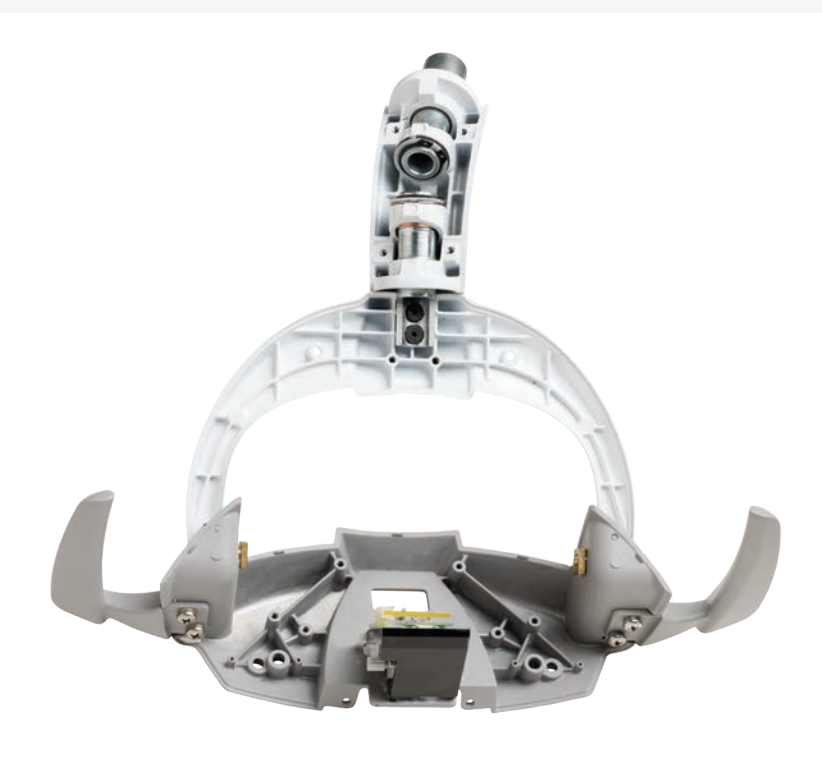
Control the light without contact using programmable no-touch sensors