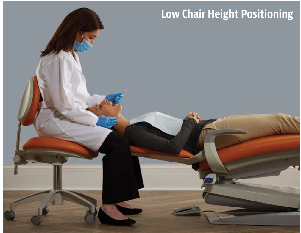
Low Chair Height Positioning

The DCI Edge operator chair provides comfort, style and efficiency. Our engineers have designed an ergonomic chair that combines a thin, narrow back with a low chair height. This allows you to be in the proper working position regardless of patient size.