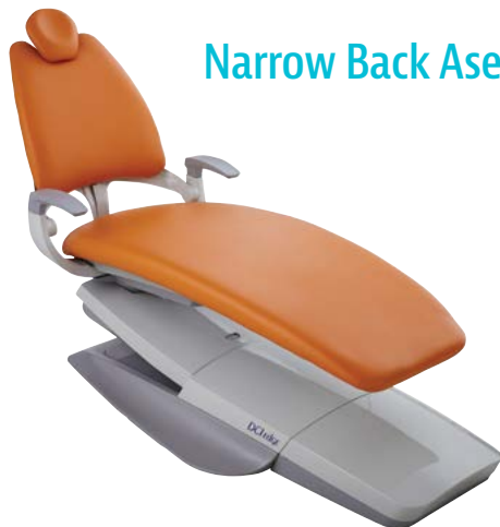
Narrow Back Asepsis