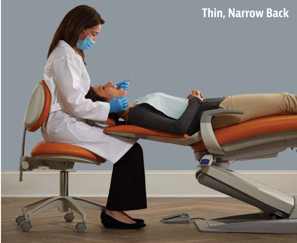
Thin, Narrow Back

The DCI Edge operator chair provides comfort, style and efficiency. Our engineers have designed an ergonomic chair that combines a thin, narrow back with a low chair height. This allows you to be in the proper working position regardless of patient size.