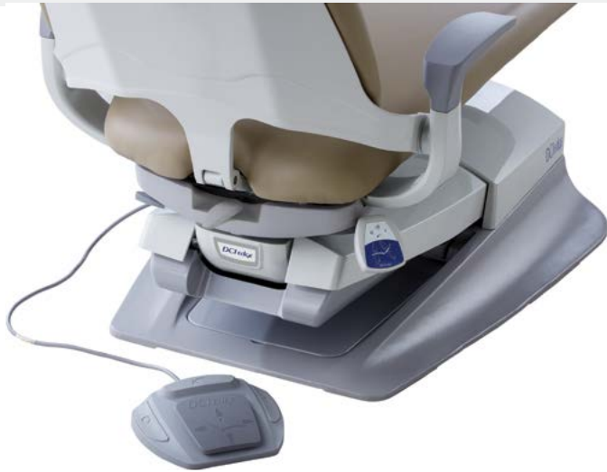
Easily operate the chair with a footswitch and optional touchpads

Work smarter, more efficiently and more comfortably