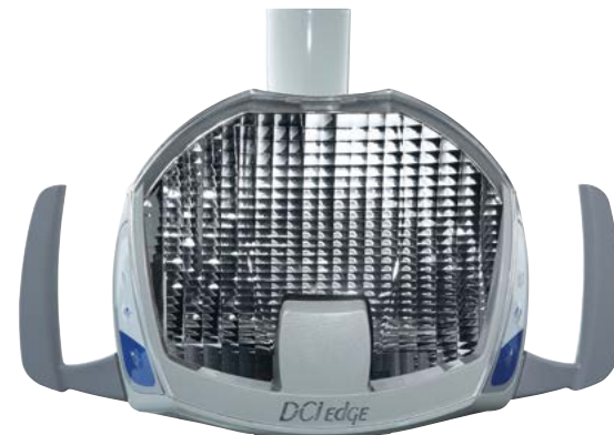
Adjust the light with dual integrated touchpads