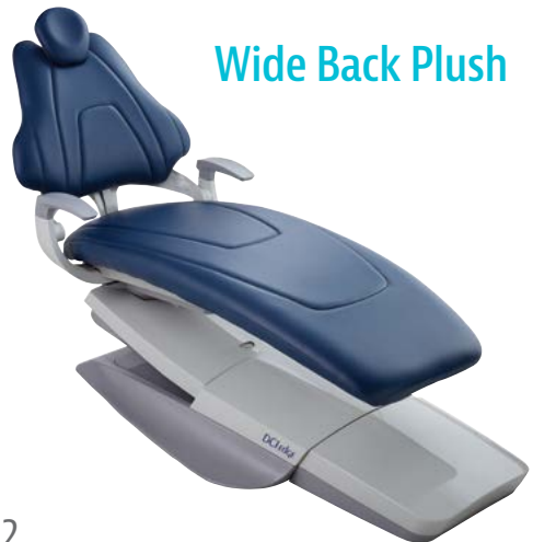
Wide Back Plush