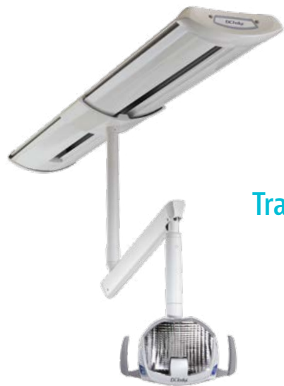
Track Mount Light