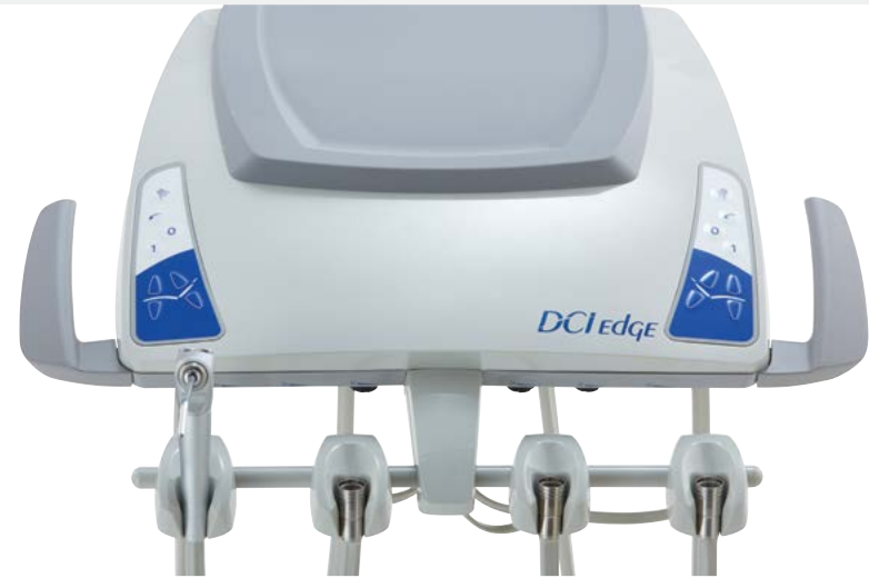
Access controls and operate the brake release from the handles