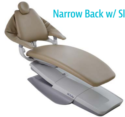
Narrow Back w/ Slings