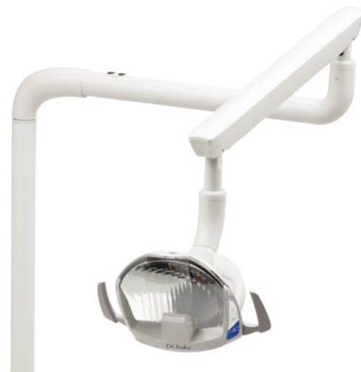
Post Mount Light