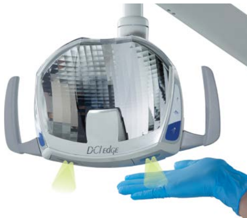
Control the light with programmable no-touch sensors